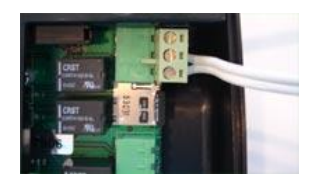
The siren relay indicated in yellow in the picture on the left. A siren interface is connected to the relay in a NO configuration in the picture on the right.

The trigger connector is rated for 12 Volts DC.