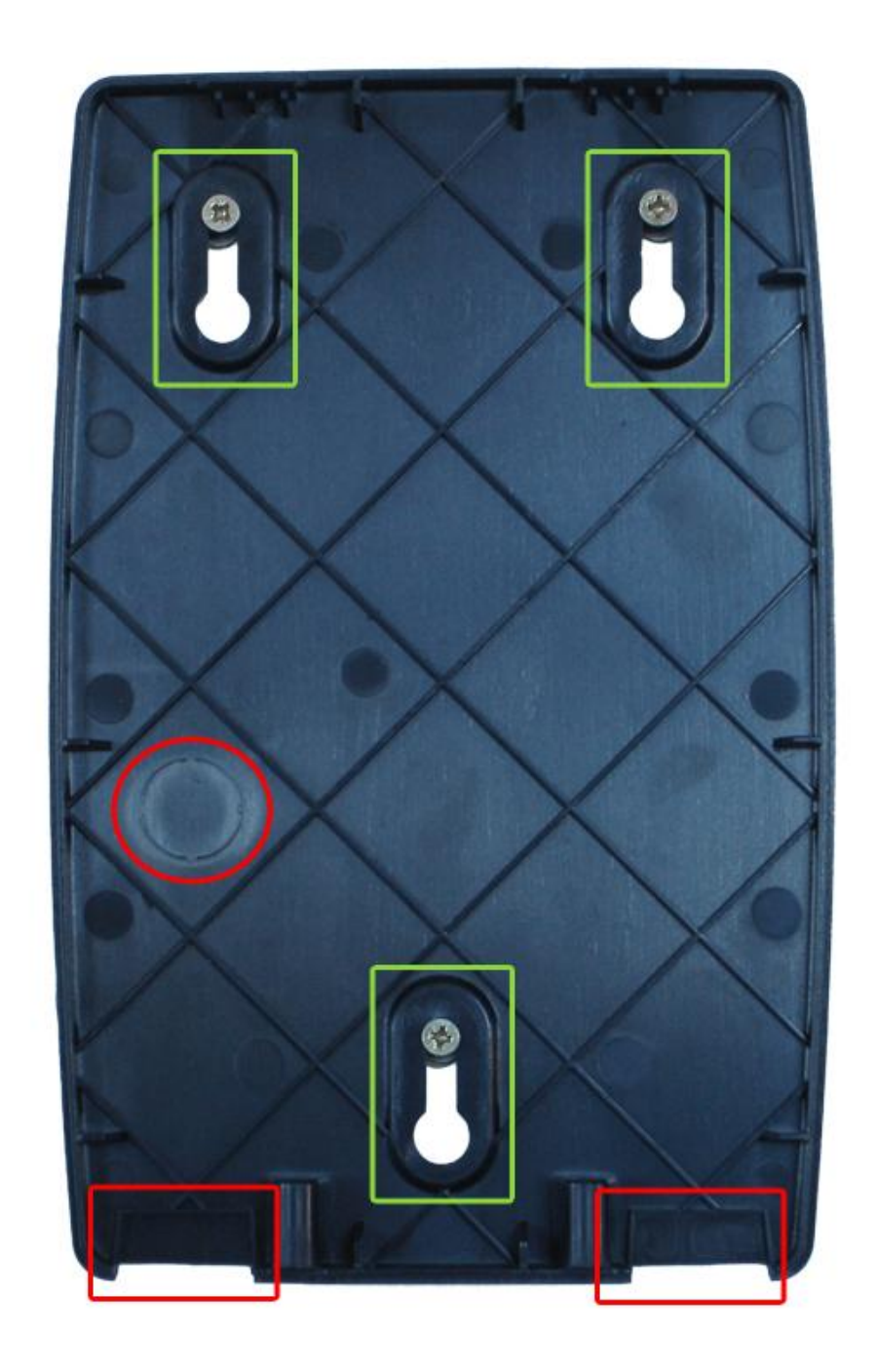
Back plate showing key holes in green and breakouts in red

• Mount the back plate as shown below and then tighten it to the mounting surface.